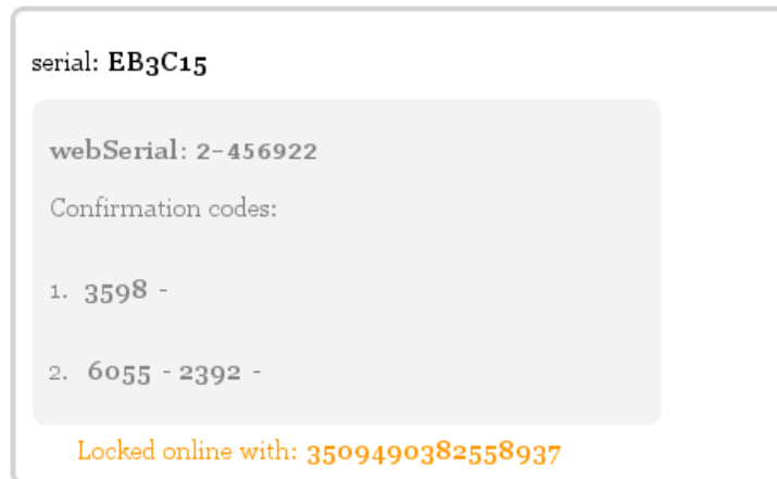
(b) Confirming LockCode